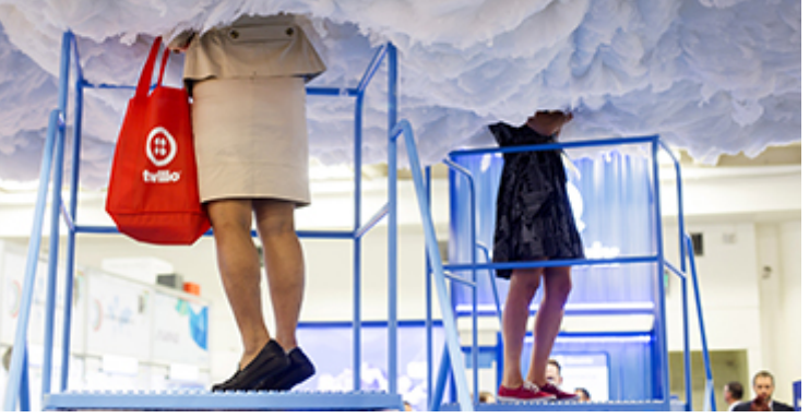
Global software company Microsoft beat market expectations, showing continued strong traction for its cloud-based solutions.

The key positive contributors to performance in the fourth quarter were Microsoft, 3M, and Hiscox. The global software company Microsoft once again beat market expectations, showing continued strong traction for its cloud-based solutions combined with healthy cash flow generation. Following strong Q3 results, the market continued to reward the global conglomerate 3M for its ability to capitalise on the improved economic outlook in Emerging Markets. In addition to a strong result, the global P&C insurer Hiscox was also helped by the prospect of higher rates following one of the worst years in history from a natural disasters point of view for the insurance industry.