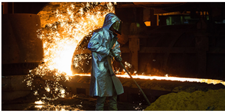
New undervalued companies entered the portfolio in Q4. One of them was the German conglomerate ThyssenKrupp.

DSV is well positioned to benefit from increased trade and e-commerce, which we think, will enable the company to sustain its impressive earnings growth. RELX Group is undergoing a massive transformation from sleepy publisher to an innovation-driven data analytics company. ThyssenKrupp is in the process of a major transformation, which we expect to result in higher margins, lower financial risk, and a lower conglomerate discount. Intercontinental Exchange should continue to drive earnings growth and margin expansion from its data business, combined with increased cash returns to shareholders.